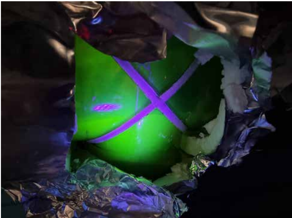
Figure 4 Tracer injection via a hose into shaft #4, accumulation of tracer in the shaft sump (experiment 2)

With the different experiments and scenarios described here, it has been shown that the real conditions in a flooded underground mine can be simulated with an analogue model mine (AMM) and that the AMM is an important tool for the investigation of flooded mines. In real mines, stable stratification was observed over months, years and decades. This stable stratification could also be confirmed in the AMM, with a shortened experimental period. Furthermore, the first flush can be simulated in the analogue model and thus examined