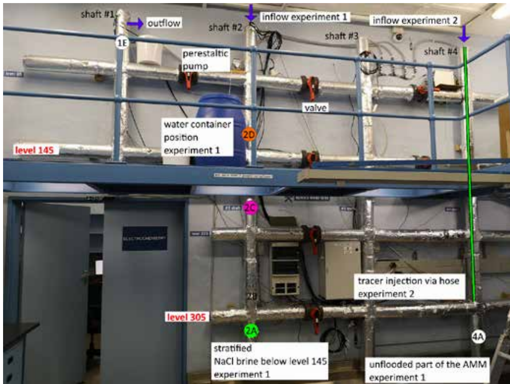
Figure 1 Agricola mine model (AMM) with water container and peristaltic pump position for experiment 1; in round circles selected injection and sampling ports; 2D (orange) injection EoY, 2C (pink) injection SRB, 2A (green) injection EoY; green hose in shaft #4 injection EoY above level 305

#2). After 69 days, the heating foil in the sump of shaft #2 was turned on to determine whether the geothermal gradient affected the stratification (heating the water to 20–21 °C). Fluorescent tracers were injected into shaft #2 at three different depths (eosinY, EoY, at section 2D, sodium rhodamine B, SRB, at section 2C and sodium fluorescein, NaFl, at section at 2A) to investigate the stability of the stratification and the first flush effect. To examine the stability of the stratification, a depth profile of the electrical conductivity was recorded in shaft #2 towards the end of experiment 1.